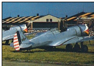
36th Pursuit Group P-36 Mohawks at Langley Field c. 1940.

22 Mar 1944 , After a brief stay in New York the 36 FG boarded the HMT Stirling Castle bound for the European Theatre of Operations (ETO).