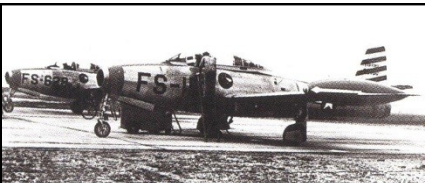
F-84 Thunderjets arrived at the 36th in 1950, the first in Europe.

1 Mar 1951 , Brig Gen Robert Lee Scott, Jr. became the 36 FBW/CC. A pilot for the WWII famous 23d Fighter Group "Flying Tigers" in China and wrote the book "God is My Co-Pilot."