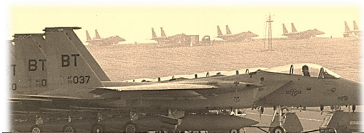
Maintenance personnel worked long hours preparing these F-15s for a mass launch at Bitburg AB, Germany.

GULF WAR—Dec 1990–Jul 1991 , the 36th deployed the 53d Fighter Squadron (FS), additional pilots and aircraft from the 22 and 525 FSSs, plus support personnel to Southwest Asia, to assist in UN operations to liberate Kuwait. Wing pilots were credited with seventeen enemy combat aircraft destroyed, 14 air to air victories. Photo: The 36th was represented in this famous photograph of oil wells burning in Iraq. The 53 TFS's flagship is the 2nd aircraft from the top.