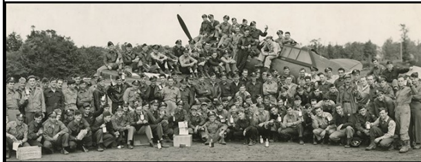
The 36th Fighter Group, poses in Western France with bottles of Champagne, gifts from Lt Gen Patton after supporting him in Sep 1944.

22 June 1943 , 53d Fighter Squadron joined the 36 FG and would remain part of the 36th for over 50 years.