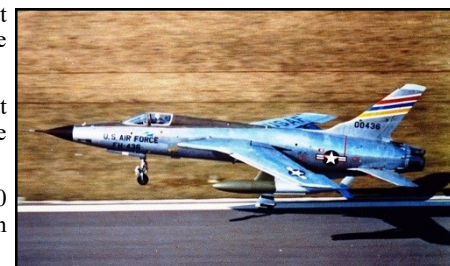
F-105 Thunderchief takes off from Bitburg c. 1961-1966.

20 Mar 1954 , first ever overseas USAF missile deployment was the 1st Pilotless Bomber Squadron (1 PBS) equipped with the BM-1 Matador missile at 36th Fighter-Bomber Wing. The MCM-13 Mace Missile, followed the Matador at Bitburg AB, W. Germany, 1962-69.