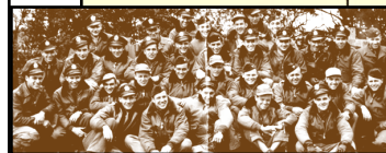
Mar 1944, 53d FS's pilots, 30% of the 33 Airmen in this photo would be KIA, MIA, or POW by war's end.