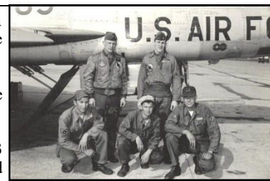
Members of the 22 FDS's 1957 Gunnery Team included pilots Capt Edwin E. Aldrin Jr. and 1st Lt Edward H. White, from left to right standing.

13 Mar 1956 , newly equipped with F-100 Supersabres , the 36th became the first wing in USAF outfitted with the supersonic jet aircraft.