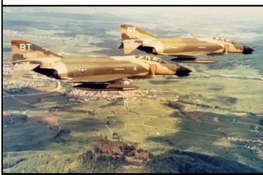
36th's F-4Ds flying over a German Castle c. Early 1970s.

12 Feb 1957, The 525th Fighter-Interceptor Squadron (525 FIS) arrived as a tenant unit, began flying operations at Bitburg originally equipped with the F-86H's and converted to the F-102A Delta Dagger in 1959.