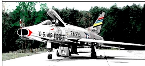
"Eifel Parrot" the 36 TFW/CC's F-100C #999 in the 22 TFS area at Bitburg, circa 1958. The 22nd maintained this aircraft for the 36 TFW.

10 Mar 1953 , 36th's international incident; two 53 FBS's F-84Gs were scrambled from Fursty to intercept two unidentified aircraft near the Czechoslovakian border. One of the Czechoslovakian MiG-15s opened fire damaging one of the F-84s enough for the pilot to bail out and the aircraft crashed.