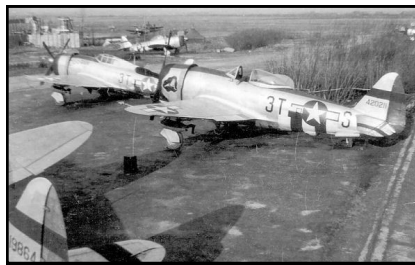
Republic P-47Ds of the 22 FS, 36 FG, at RAF Kingsnorth, England. Later, S/N 44-19864 (Bottom Left) was lost to flank during the Battle of the Bulge with pilot 1Lt Charles Loring who became a POW.

16–25 Dec 1944 , the 36th participated in the Battle of the