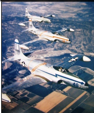
Three squadrons of the 36 FW F-80 Shooting Stars over Germany circa 1948-49.

Feb 1946 , the 36 FG, less personnel and equipment, departed Europe and moved to Bolling Field, Washington, D.C.