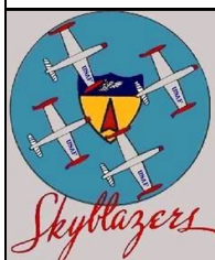
Skyblazer original emblem c. 1950-52

13 Aug 1948 , ferry flights began and all 82 F-80s were in place at "Fursty" by 20 August. The wing became the first US jet fighter-equipped unit stationed in Europe.