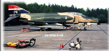
F-4E Phantom II, 36th Tactical Fighter Wing celebrated America's Bicentennial.

1 Nov 1968, the 525 FIS, still flying F-102s, were assigned to the 36th instead of being a tenant command at Bitburg.