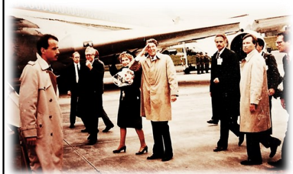
5 May 1985 , President Ronald Reagan during his controversial visit to Bitburg Cemetery. The 36th supported this visit with many of the base's Airmen. Photo: President and First Lady boarding AIR FORCE ONE on Bitburg AB's ramp.

27 April 1977 , arrival of the first F-15 Eagle squadron made the 36th the first wing outside the continental US to fly this fighter. The 525 TFS was the first squadron to bring F-15s to Europe.