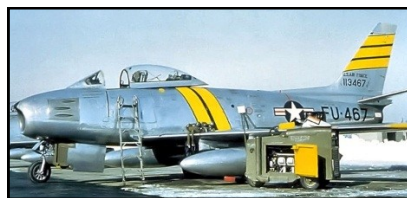
53d Fighter Day Squadron's F-86F Sabrejet

11 Aug 1951 , the group provided 44 aircraft for a static display and a Skyblazer demonstration to future president Gen Dwight D. Eisenhower.